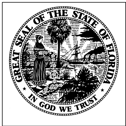
Florida Department of Education