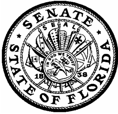
The Florida Senate