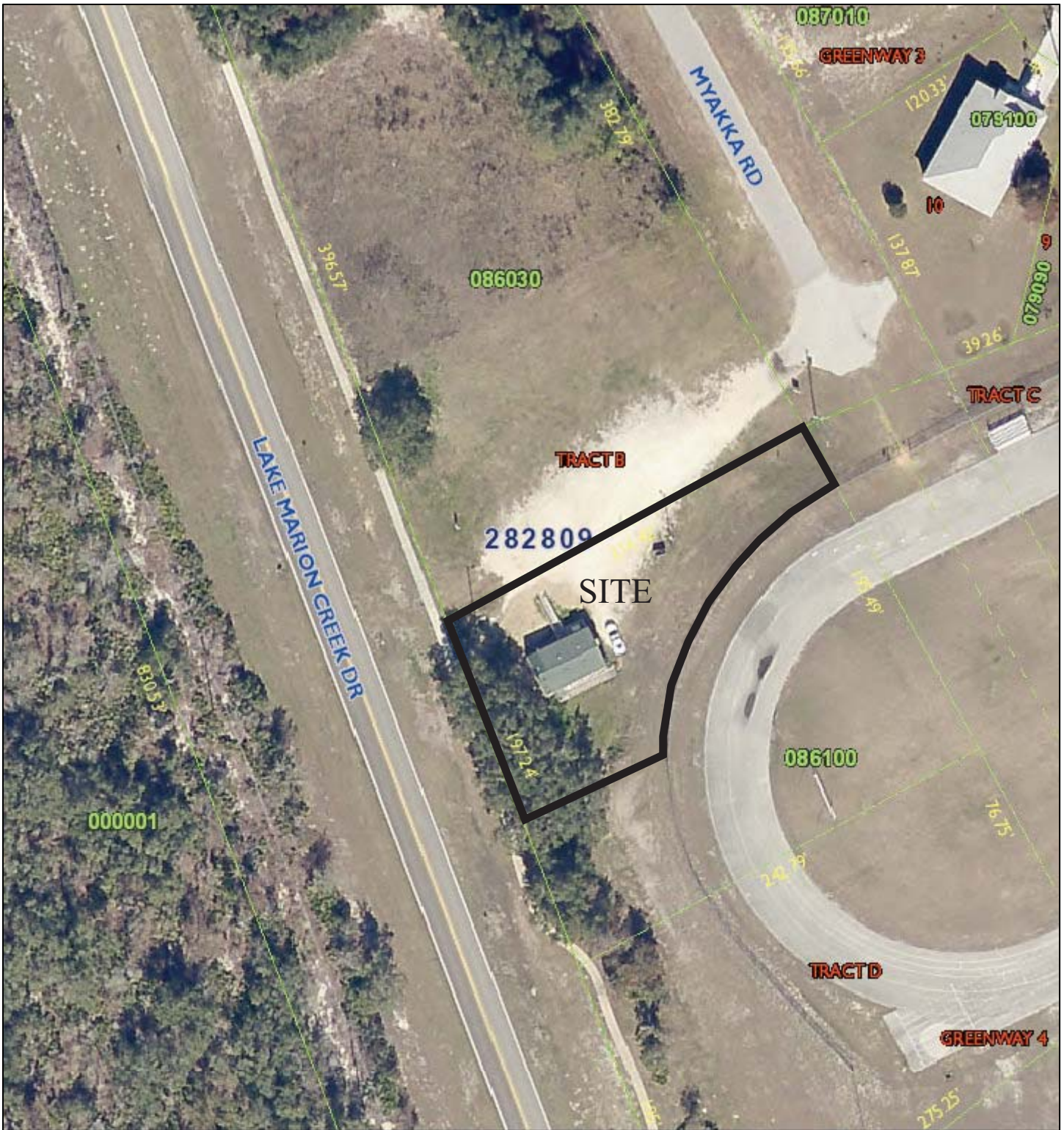
EXHIBIT "A" LEASED PREMISES

Part of Parcel Number 282803-934760-086100 Site located in the Northwest corner of said parcel. Section 3, Township 28 South, Range 28 East Polk County, Florida