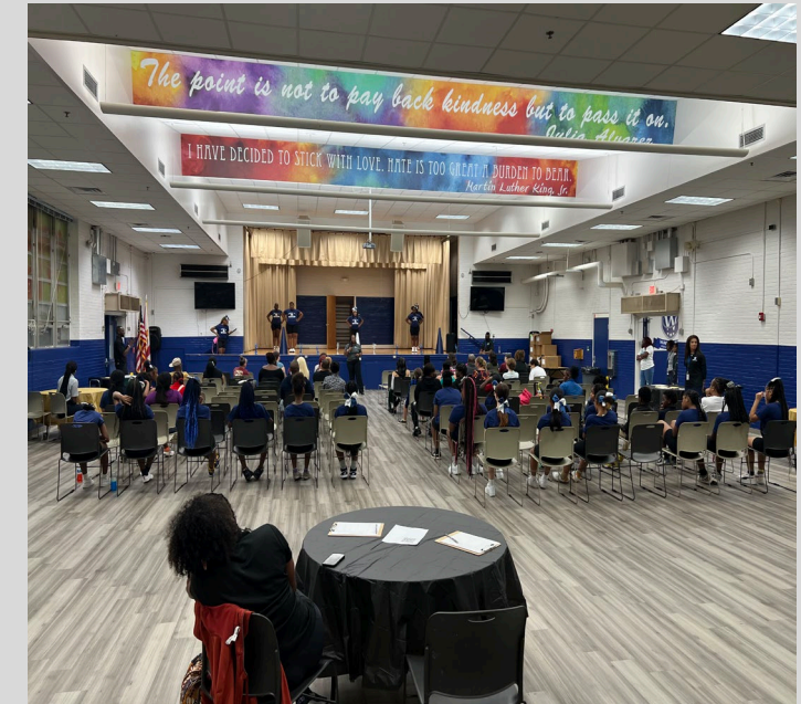
Star Student Celebration