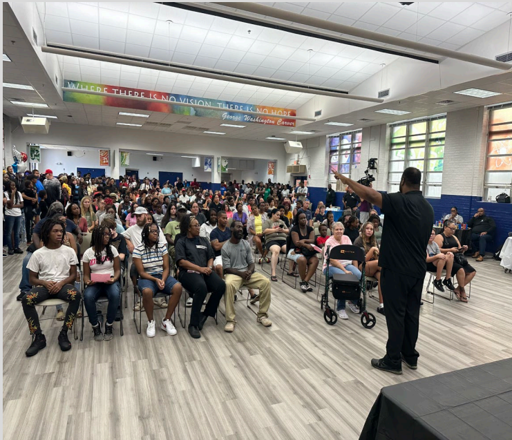
Student Orientation & Open House